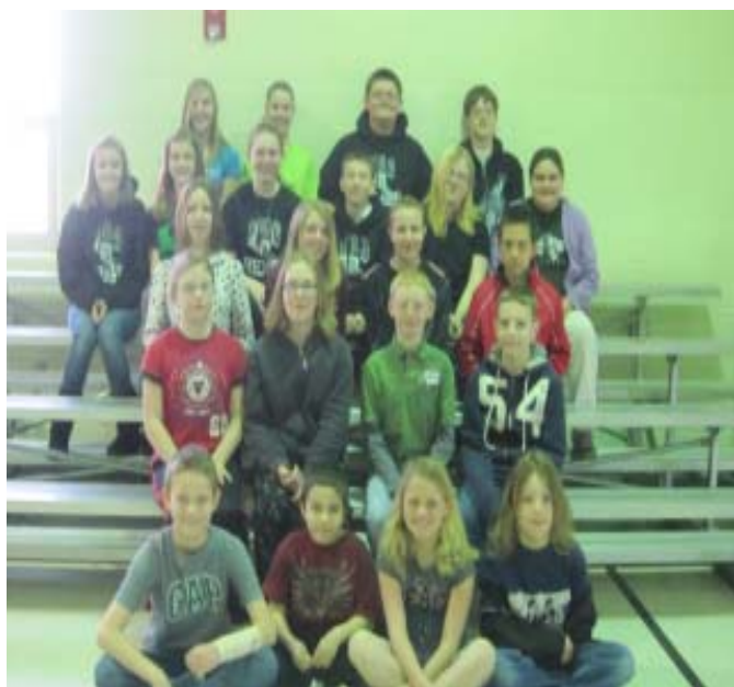
All Math Contest Participants